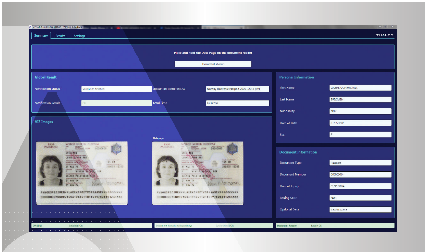
Thales Gemalto DV Sample Application