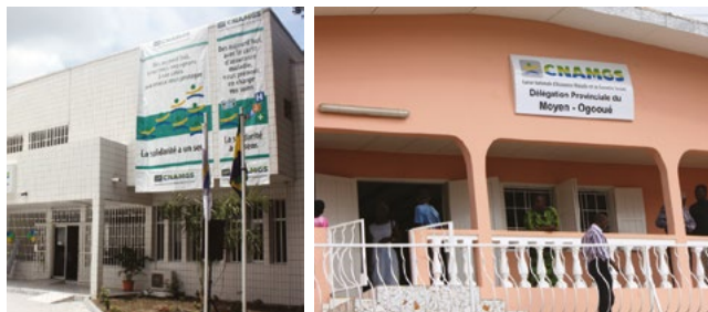
Port-Gentil and Lambaré buildings just opened

The ambitious schedule incorporated a pilot phase from December 2008 to March 2009, then a roll-out until 2011 when all dependents of the three funds, the GEFs as priority, had to be registered.