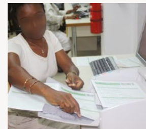
Centralized scanning in Libreville

The GEF registration campaign was deployed in the field, with CNAMGS officers available to the population, inviting GEFs to visit them in registration centers specially setup in the town halls of major provincial centers first and then being taken into the departements. The GEFs were initially slow to take up the chance to be covered by social health insurance since people didn't believe that they would be looked after. A communication campaign for the general public was therefore implemented at the end of 2009 to inform the entire nation. By 2011, nearly all of the eligible beneficiaries identified previously were signed up.