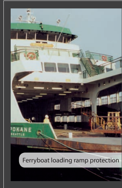
Ferryboat loading ramp protection

Polyshield HT-100F™ is a fast-set, high-performance, spray-applied, plural-component, pure polyurea elastomer. This system is based on amine-terminated polyether resins, amine chain extenders, and prepolymers. It provides a cost-effective flexible, tough, resilient monolithic membrane with water and chemical resistance. Polyshield HT-100F™ is an excellent choice of elastomer to topcoat geo-textile fabrics for primary or secondary containment.