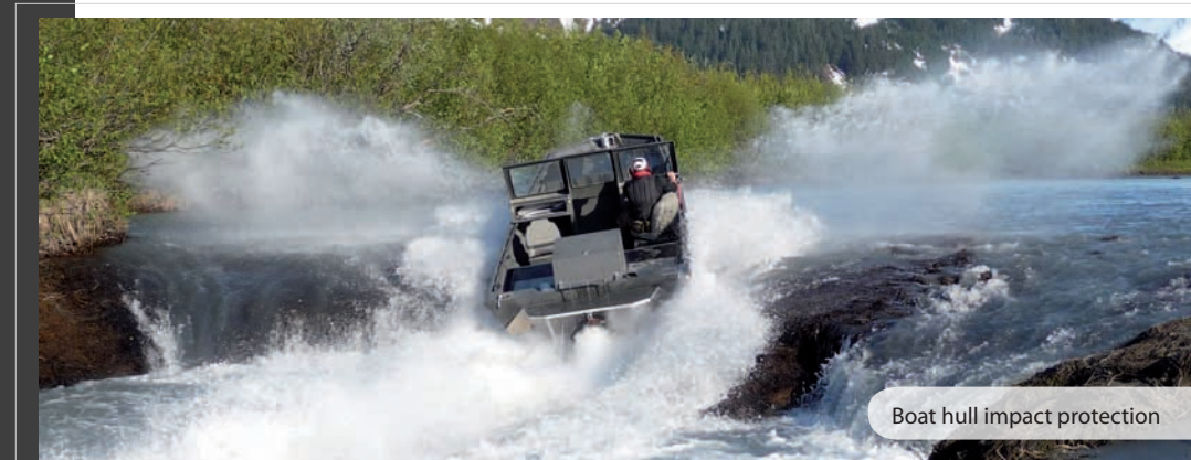
Boat hull impact protection