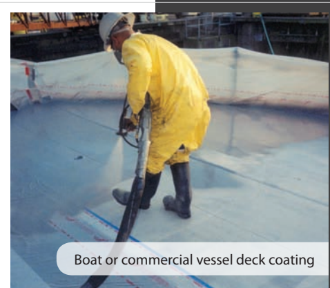
Boat or commercial vessel deck coating