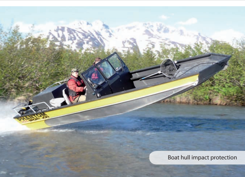
Boat hull impact protection

Specialty Products, Inc. is widely recognized as a global market leader and innovator in manufacturing polyurea elastomeric coatings, polyurethane foam systems, and plural-component application equipment. SPI's products are manufactured under a stringent quality assurance program. SPI offers year-round 24/7 technical support, backed by a dedicated staff with over 150 years of collective industry experience. For over 37 years, our customers have relied on SPI's industry leading products and unmatched technical support. We invite you to experience the SPI service difference!