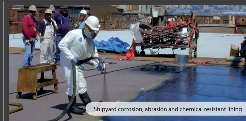
Shipyard corrosion, abrasion and chemical resistant lining