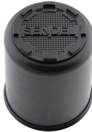
MATTE BLACK CAP