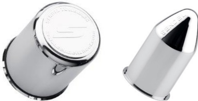
CHROME CAP / CHROME PLUG