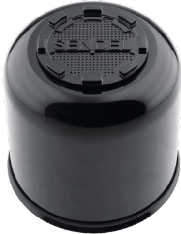
GLOSS BLACK CAP