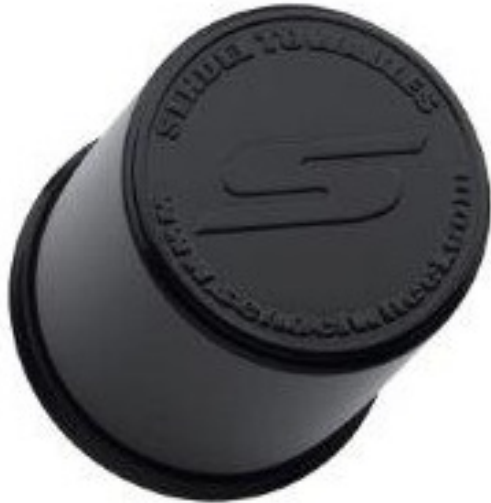
BLACK CAP / BLACK PLUG