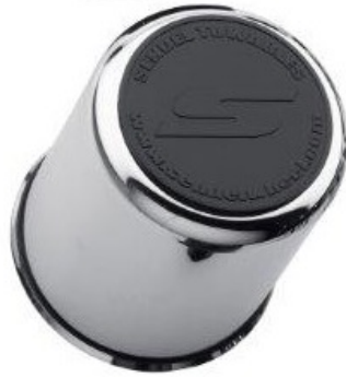
CHROME CAP / BLACK PLUG