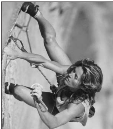
Lynn Hill in 1994.

will always limit the numbers of hardcore women alpinists.”