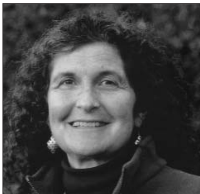
Arlene Blum in 2005. Annalise Blum

But climbing isn't just about proving yourself, of course: it's also fun. Many of today's most active female climbers climb "en cordée féminine" simply because they enjoy the comfortable dynamic—the camaraderie—special to climbing in an all-women's team. By the same token, I suspect, many men prefer to climb with other guys.