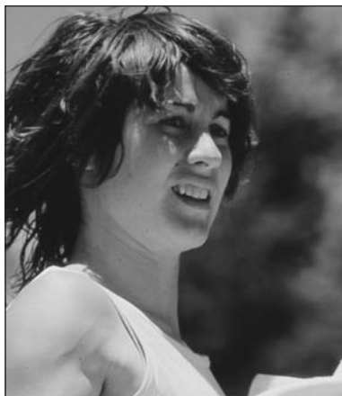
Catherine Destivelle in 1988.

earlier draft of this essay and embedded this comment in the manuscript: “Why is there such a double standard in women’s climbing? I either know or know of every woman in this article. I doubt I would have heard of most of them if they were men, given their level of accomplishment. Sounds harsh, but it’s true. I don’t know the names of half the Americans doing good repeats in the mountains.”