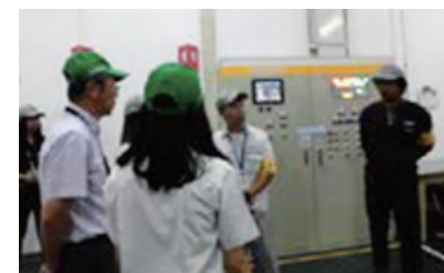
Environmental mutual audit (Thailand)