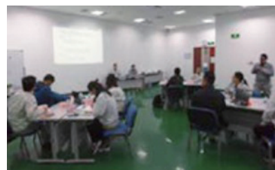
Environmental education (China)