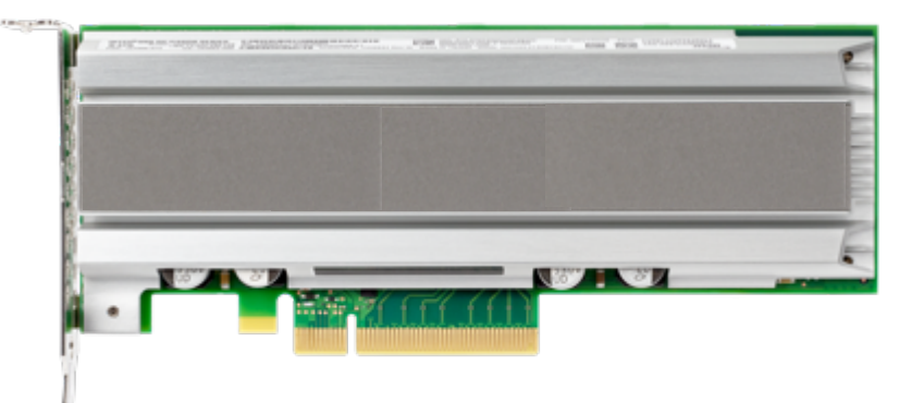
Fig 2: Flash Accelerator PCIe Card

This performance is orders of magnitude faster than traditional storage array architectures, and is also much faster than current all-Flash storage arrays. Note that these are real-world end-to-end performance figures measured running SQL workloads with standard 8K database I/O sizes inside a single rack Exadata system. Storage vendor performance quotes are usually based on small I/O sizes and low-level IO tools and therefore are many times higher than can be achieved from SQL.