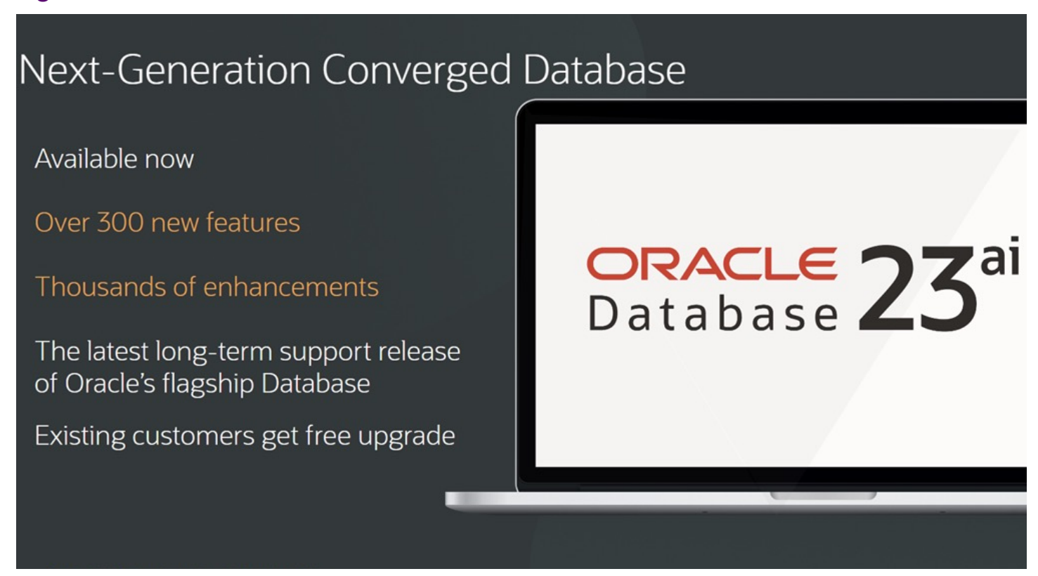
Figure 2. Oracle Database 23ai Overview

More specifically, Oracle is delivering the following distinctive capabilities (see Figure 2):