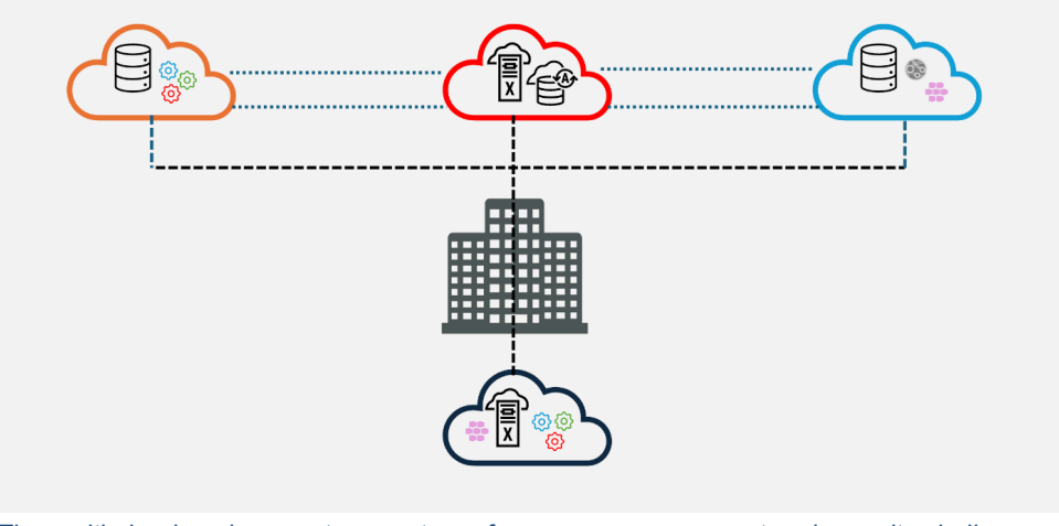
The multi-cloud environment presents performance, management and security challenges