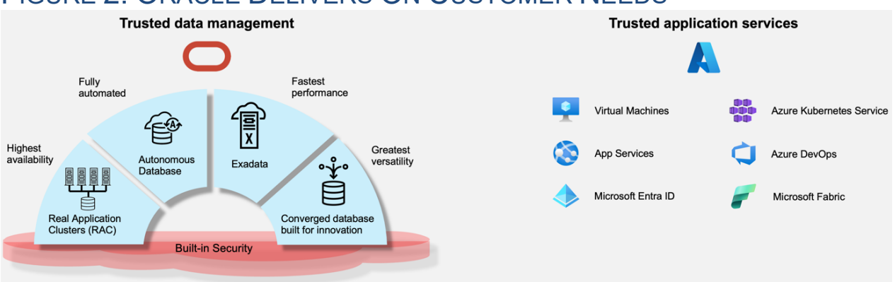
FIGURE 2: ORACLE DELIVERS ON CUSTOMER NEEDS

From an operations perspective, the native integration of Oracle Database@Azure delivers a seamless experience. This service can be provisioned directly from the Azure console and consumed with Azure credits. Meanwhile, Oracle continues to manage the infrastructure and Oracle Database services via the Interconnect for Azure.