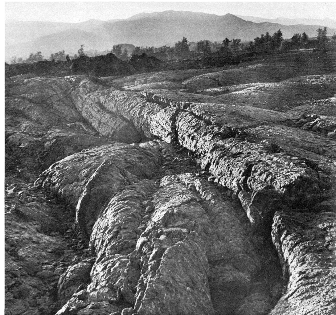
Pahoehoe lava near Indian Tunnel

Comparatively little of the vast lava flow which covers most of the monument has erupted from craters, for it is evident that most flows oozed in peaceful fashion from numerous fissures and openings of the Great Rift. There are two types of lava flow: the aa (pronounced ah'-ah) which is extremely rough, broken into irregularly shaped blocks with jagged corners