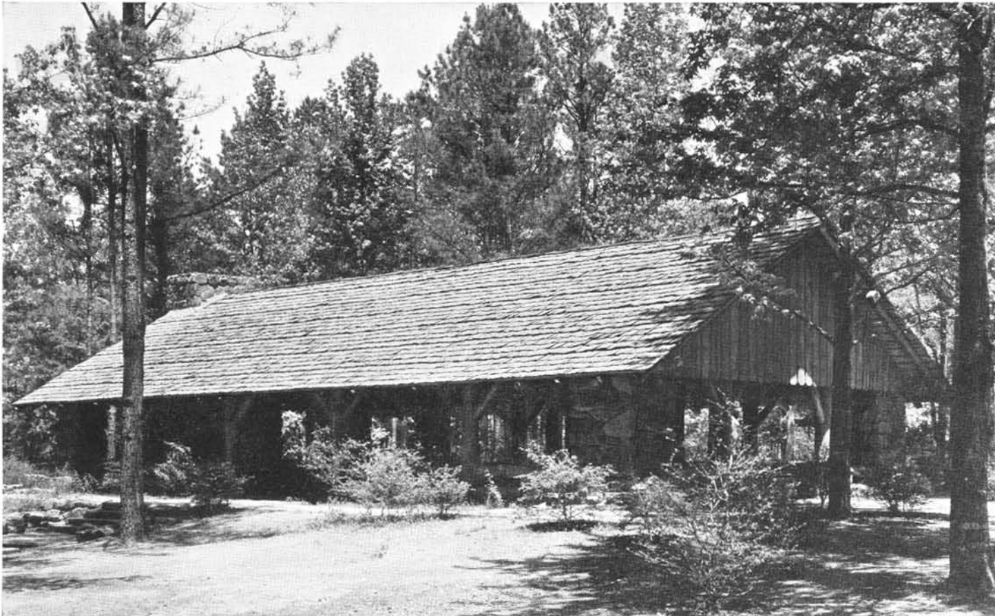
Shelter, Boyle State Park, Arkansas