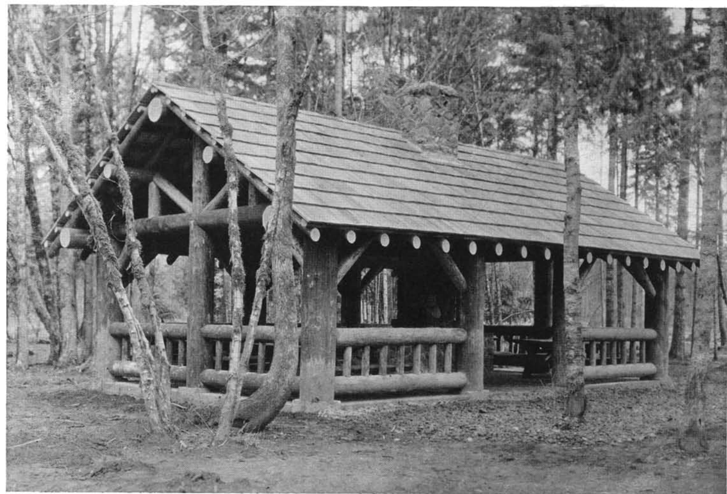
Community Kitchen, Rainbow Falls State Park, Washington

A facility significant of the climate of the Northwest where the mortality rate of picnics in the open relates directly to heavy rainfall. Here are exemplified massiveness of log construction and shakes scaled to the abundance of native cedar, but there is an uncompromising sharpness to the rafter and purlin ends that makes one wish that axe and draw-knife, rather than a saw, had been employed. The facilitating equipment consists of sink, double stove and four table and bench combinations, the latter in an intimate proximity that only a down-pour would render inviting.