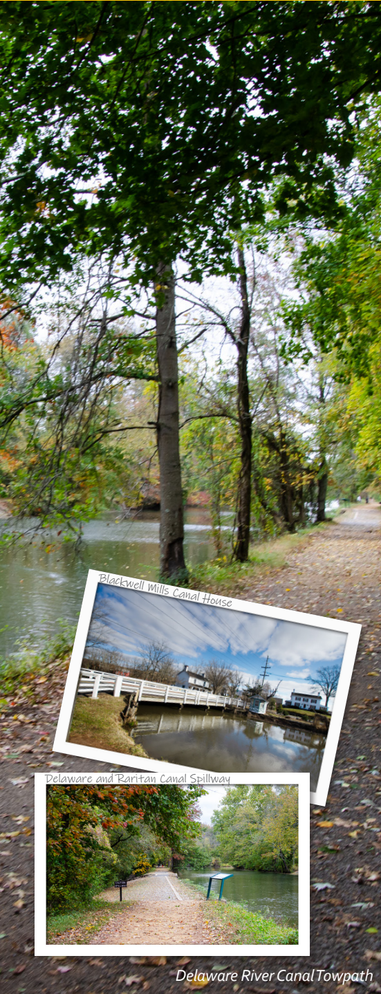
Blackwell Mills Canal House