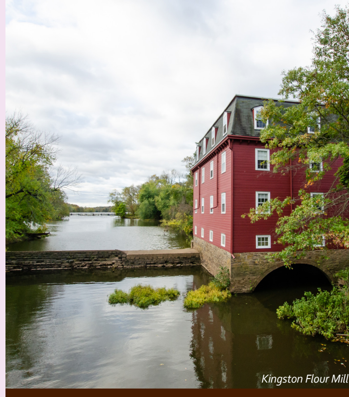
Kingston Flour Mill

The Millstone Valley Scenic Byway is one of New Jersey's eight scenic byways, transportation corridors that have outstanding scenic, natural, recreational, cultural, historic or archaeological significance. Together, the byways tell stories about New Jersey's history, natural features, recreational opportunities and beauty.