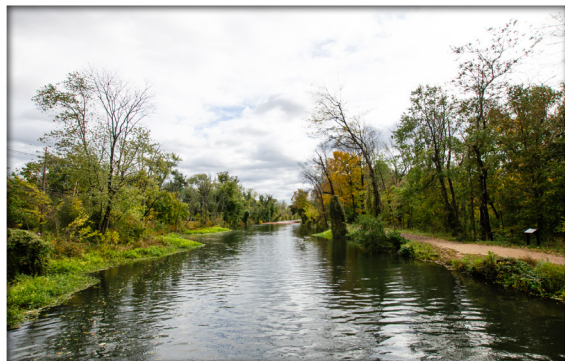
View from Blackwell Mills Canal House

Take in the peaceful, natural beauty of the D&R Canal as you explore the byway. Open for kayaking, canoeing and sightseeing, the D&R Canal is equal parts fun, historic and picturesque.