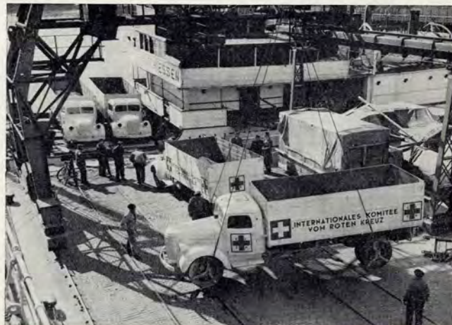
Swedish trucks leaving Goteborg for Lübeck, Germany. These trucks, plainly marked in German, International Committee of the Red Cross, were used for delivering relief supplies to camps and marching columns in northern Germany.