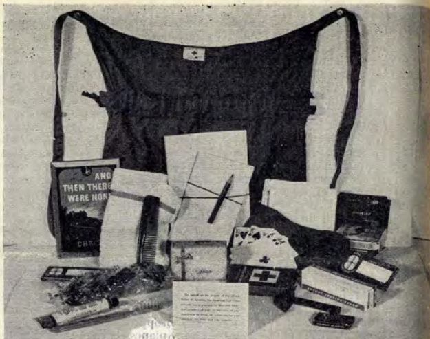
For use on the journey home, Red Cross release kits are distributed to American prisoners.

Machines, the marvels of modern inventive ingenuity, cannot take the place of human beings. In the final analysis, manpower will win the war, and, for victory, precious personnel will continue to be lost. The Navy is keenly aware of the fact that nothing can compensate for the loss of those dear to us. The countless billions the war is costing in materiel seem infinitesimal when we learn of a loved one's death. The American people are facing the sacrifices war entails with bravery and fortitude.