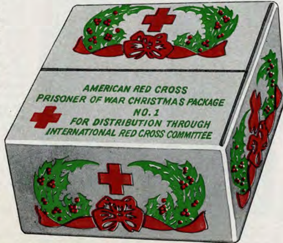
Ten thousand of these special packages were shipped to Europe for distribution to American prisoners at Christmas.

These Gripsholm supplies, which were transferred to a Japanese ship at Morogao under International Red Cross Committee supervision, were unloaded during November at the designated points in the Far East. Assuming no undue delays have occurred, there has thus been ample time for the food, clothing, medicines, and other supplies to reach the men in the Far East camps by Christmas.