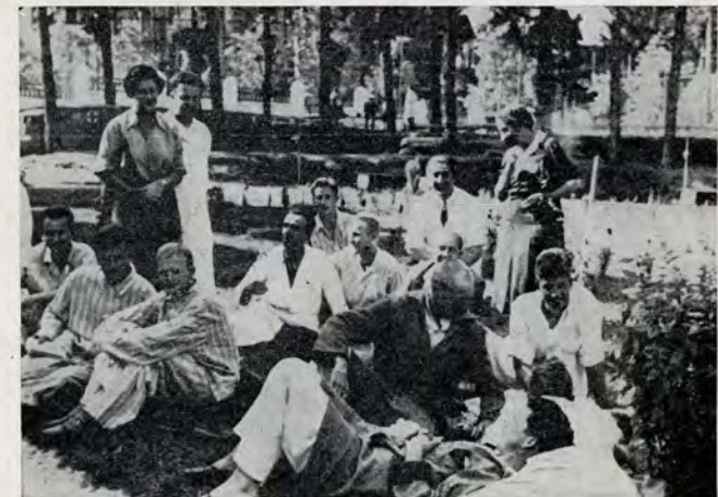
Convalescing American flyers, with International Red Cross delegate and Rumanian Red Cross nurses, in the hospital grounds at Sinaia.