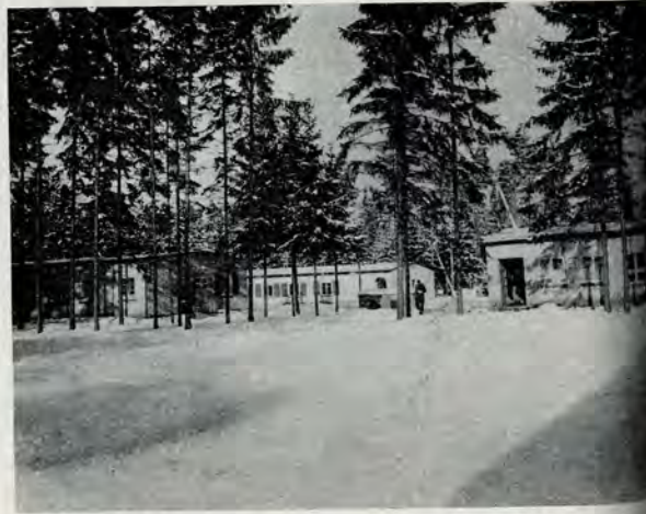
A German prison camp in winter—Stalag VIII B. This is mainly a British camp but it contains American prisoners.

Like the British, the Americans in this camp are said to be eager for the opportunity to take examinations, and are anxiously awaiting university and high school programs. "On the whole," the report concludes, "the Americans are rather well here, and I have not heard any