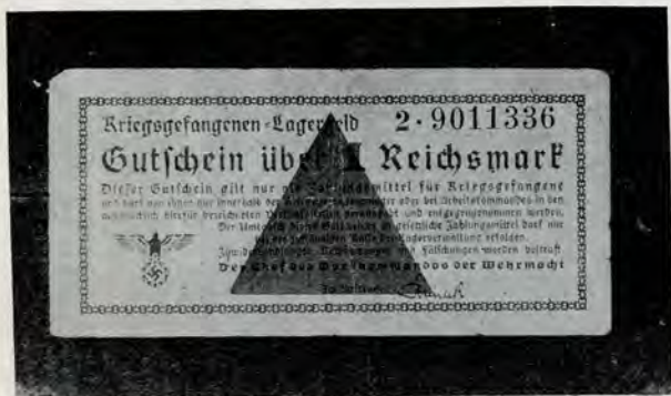
Prisoners of War Camp Money.