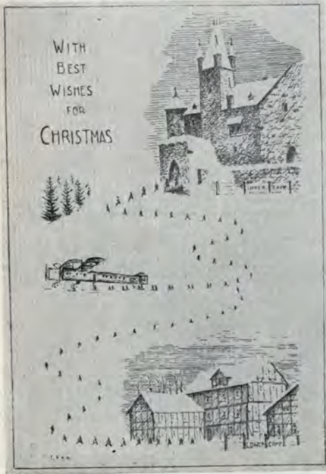
Prisoners' hope for 1944 at Oflag IX A/Z—to leave for home by plane.

Promptly after the ship docks at Marseille and the freight cars are drawn up alongside, the mail is unloaded. One steamer recently carried some 10,000 sacks of letter mail and next-of-kin packages, or enough mail for an entire train. The mail train, sealed and guarded by the French authorities, leaves the same night for Basel, Switzerland, and from there goes direct to the main German censorship and distribution center for prisoner of war mail at Stuttgart.