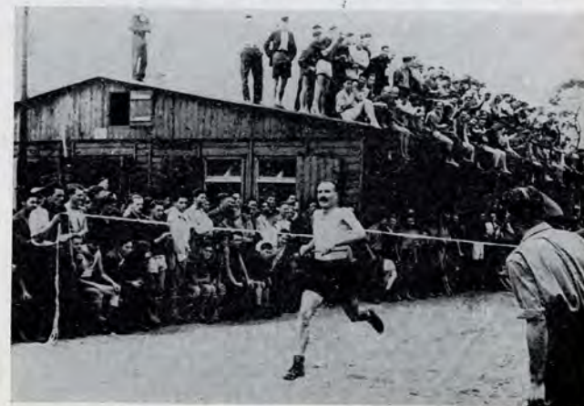
Sports Day at Stalag Luft III.