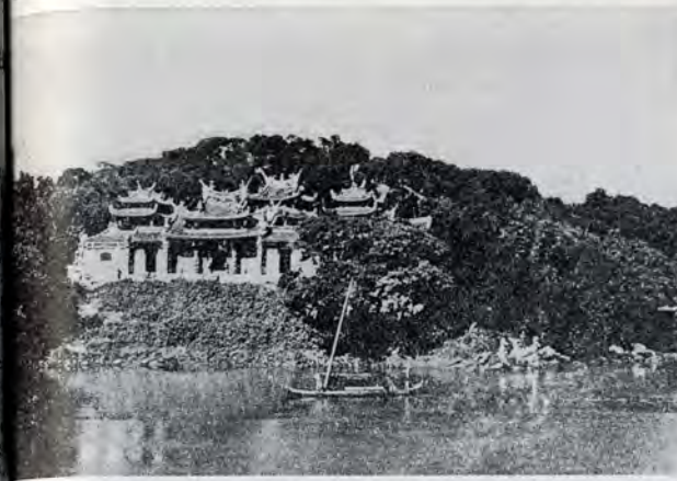
The Kentanji Temple at Taihoku, visible from the Taihoku Prisoner of War Camp on the Island of Taiwan, was originally built by the Chinese in 1740. The temple enshrines the Goddess of Mercy.

The financial condition of the prisoners appears to be good. Officers use part of their allowances for food, clothing, cigarettes, and daily necessities, while the men spend their money for tobacco and such other items as are available. Each camp has a canteen with a limited supply of