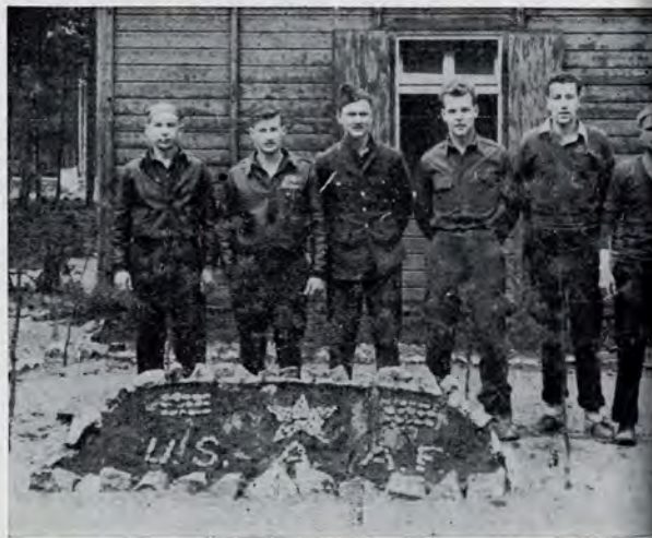
Group of American aviators, including at least two pilots of Flying Fortresses, are among the approximately four hundred American flyers at Stalag Luft III, Germany.

A great amount of painstaking effort and resourcefulness is devoted to getting out these camp sheets. Pre-