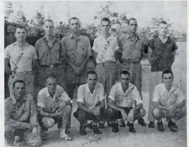
American prisoners of war at Zentsuji. This group includes five aviators from the U. S. S. Houston

Sports space is provided for baseball, cricket, and deck tennis, with a "gymnastic excursion" outside the camp once a week. Radio is available, for local reception, and a library of some 500 books was obtained from