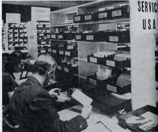
The Central Agency of the International Red Cross Committee at Geneva card-indexes all prisoners of war. This picture shows the American Section.