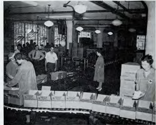
Four months after its official opening on March 3, 1943, the Red Cross Packing Center No. 1, in Philadelphia, had made up over 700,000 prisoner of war food packages.

practical proof that he or she is more nearly related than a first cousin to a prisoner, other than American or British, held in Italy.