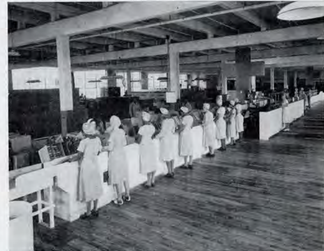
The Wm. Wrigley Jr. Company in Chicago using one of its assembly lines for packing prisoner of war packages for the American Red Cross.

In all respects, the War Department states, prisoners of war in the United States are treated with the respect due honorable soldiers, and it is hoped that the humane and considerate treatment accorded America's prisoners will be reflected in similar treatment of American soldiers who are prisoners of war of the Axis Powers.