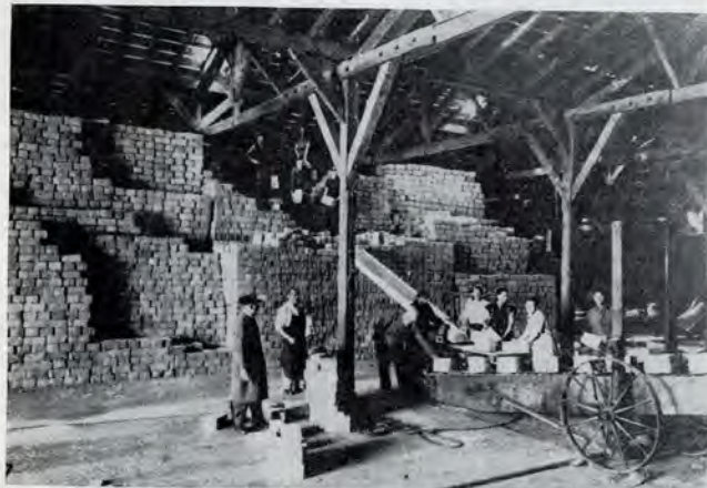
Prisoner of war relief packages leave International Red Cross Committee Warehouse in Switzerland for Axis prison camp.