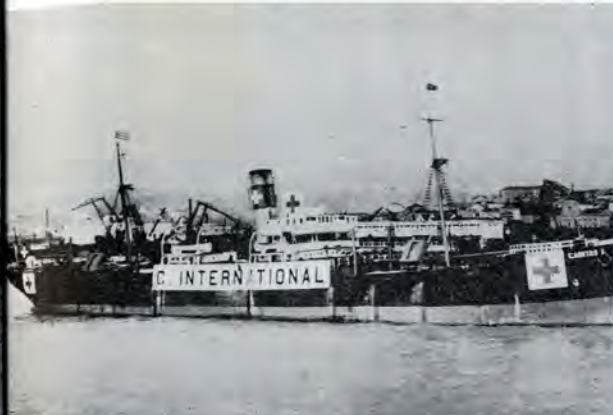
Red Cross ship Caritas I at a European Port.

to agree to the transfer to Swiss registry, for Red Cross purposes, of ships which hitherto had sailed under belligerent registry. The result of this has been the setting up of a new organization for the purpose of operating such ships. This is the Swiss Foundation for Red Cross Transports, incorporated in Switzerland under Red Cross auspices and announced officially on April 23, 1942. The Caritas I , the first boat acquired by the Foundation, has just completed her second voyage direct from Philadelphia to Marseille, entirely laden with American Red Cross supplies. She is the first prisoner of war relief ship to sail from the country of one belligerent to territory occupied by an enemy belligerent.