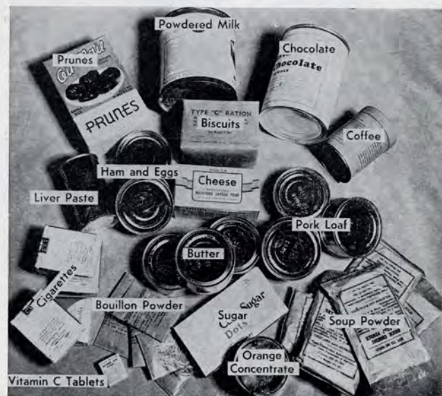
Contents of the invalid food parcel packed by Red Cross volunteers in the New York Packing Center. This parcel is for prisoners recovering from illness or wounds.

Cotton, absorbent, USP, 1/4 lb. pkg. 1 pkg. Phemerol topical (mild germicide), 1 oz. 2 pkgs. Dressing, gauze, 3"x3", sterile, in envelope 50 envelopes Adhesive, USP, 3"x5 yds. 1 roll Readi-bandages, 1"x3", 100 in box 1 box Pins, safety, assorted sizes 3 cards or 3 doz. Aspirin, tablets, 5 grains, 500 in carton 1 carton Soda, bicarbonate, USP, 5 grain tablets 1 pkg. Cathartic, compound, pills, NF VI, 500 in carton 2 cartons