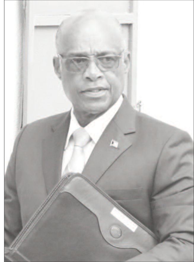
► Minister of Education Jeffrey Lloyd

Mr. Lloyd added that the virtual platform for learning, which was launched in September 2019, is currently being