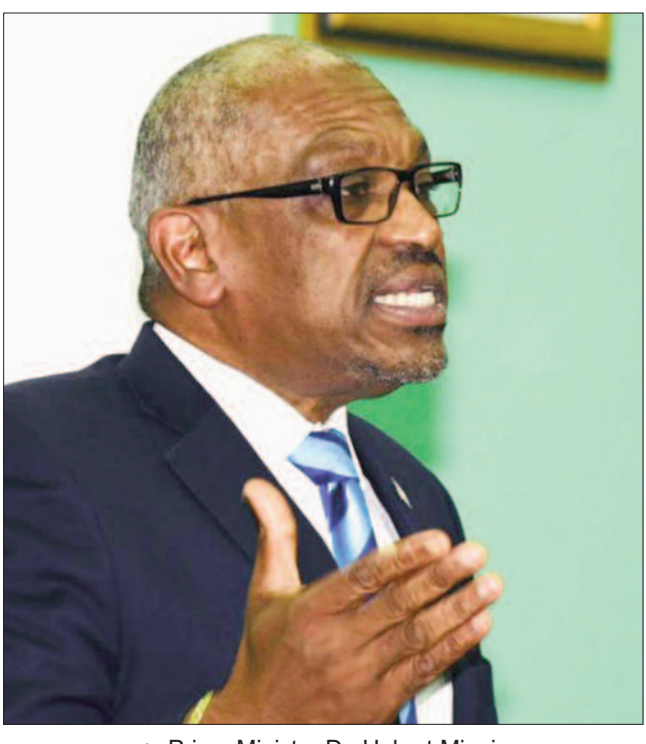
▶ Prime Minister Dr. Hubert Minnis

T wo more persons have tested positive for COVID-19, bringing the total number of confirmed cases in The Bahamas to three. Prime Minister Dr. Hubert Minnis announced the additional COVID-19 cases in the House of Assembly yesterday. "Late last evening health officials confirmed two additional cases of individuals who tested