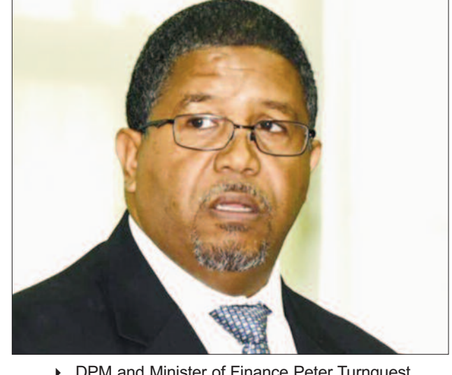
▶ DPM and Minister of Finance Peter Turnquest

An additional $11 million has been allocated for the health sector to assist in the fight against COVID-19, according to Deputy Prime Minister and Minister of Finance Peter Turnquest. In the House of Assembly on Wednesday, Turnquest listed a com-