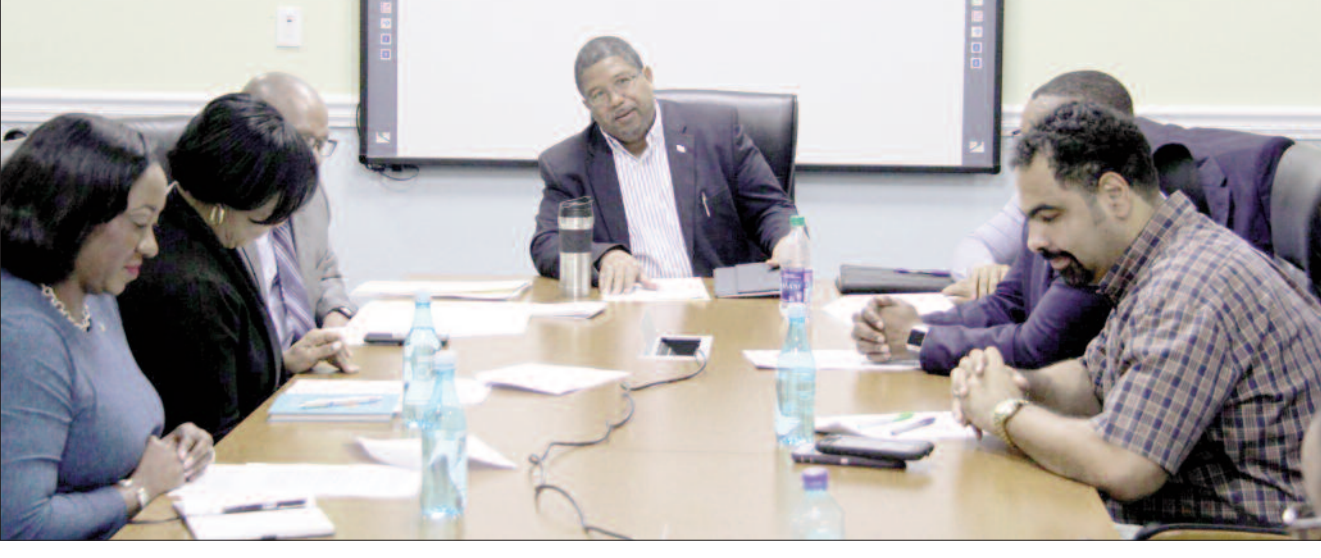
Deputy Prime Minister and Minister of Finance Peter Turnquest meeting with economists and a range of stakeholders from the private sector on Monday to discuss "Recommendations for Mitigating the Economic Fallout of COVID-19."