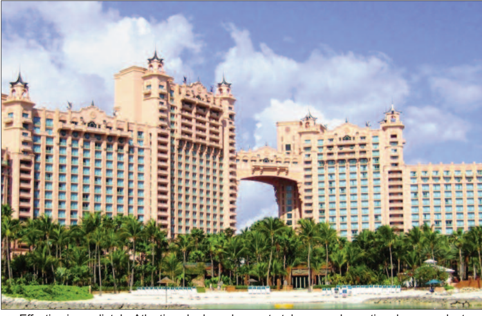
Effective immediately, Atlantis asked employees to take earned vacation days or volunteer to take two weeks unpaid leave as the resort shoulders the burden of the impact of COVID-19.