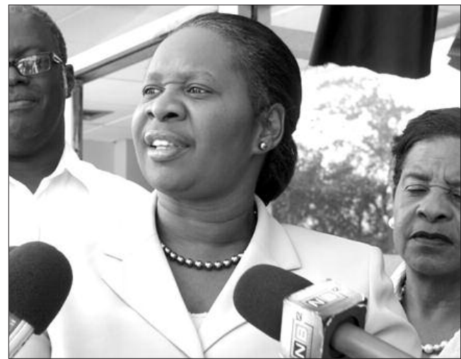
▶ BUT President Belinda Wilson

Minister of Education Jeffrey Lloyd promised to give additional details on virtual schooling, upcoming examinations and lunch programs in the House of Assembly on Wednesday.