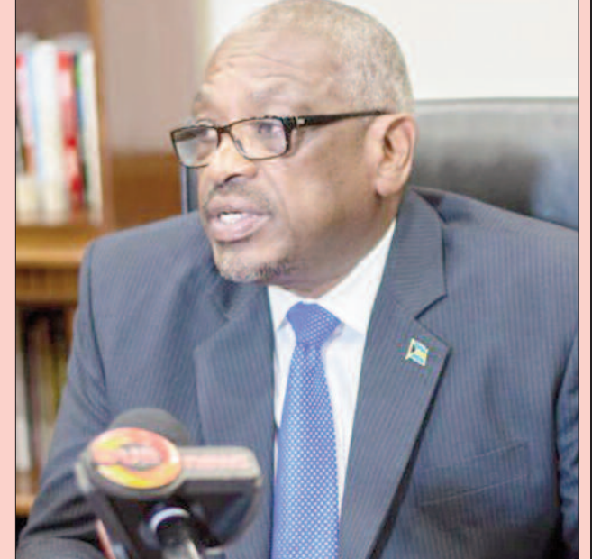
▶ Prime Minister Dr. Hubert Minnis

"I want to assure the population that we have at least a one to three