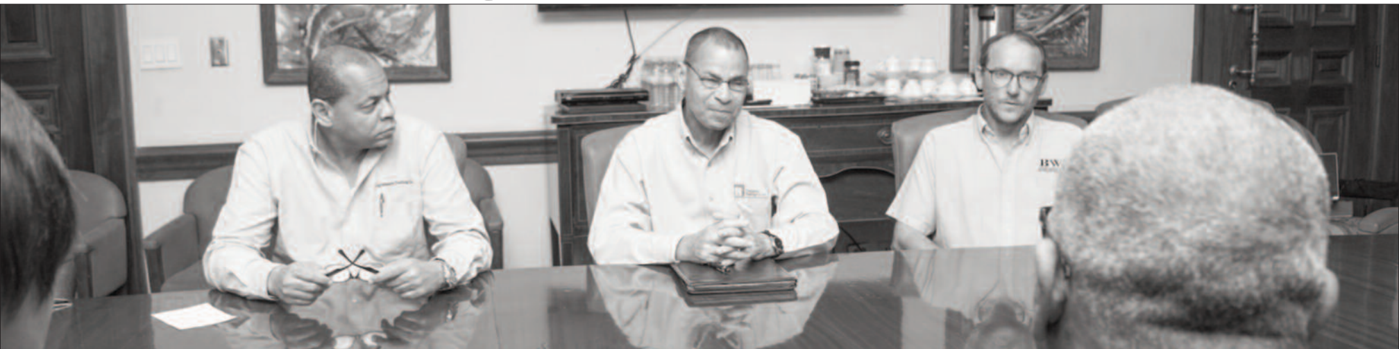
► Prime Minister Minnis meets with local wholesalers and distributors on Tuesday.