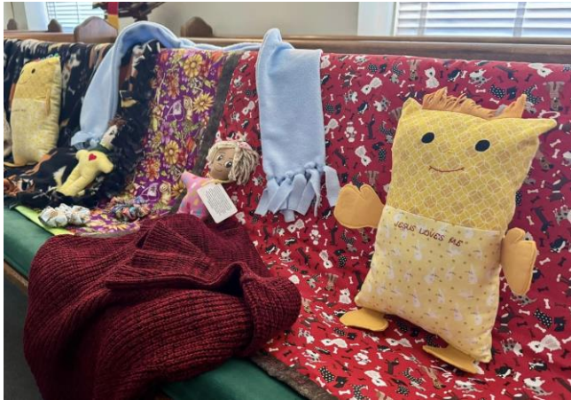
Handmade quilts, blankets, and pillow buddies.

MT. ZION: Non-perishable food leftover from VBS was donated to the Knights' Pantry. Veteran's Day cards were sent to veterans in the community, thanking them for their service. Several have expressed how the thoughtfulness blessed their hearts. The church family is currently collecting items to send to a member in the military. During the worship service on Sunday, November 19, a prayer of blessing was said over the donated items and handmade items for Hope for Appalachia. Additionally, they prayed for the people going on the trip, the children receiving the items, and the teachers and staff of the schools there. After the service the members enjoyed a Thanksgiving meal.