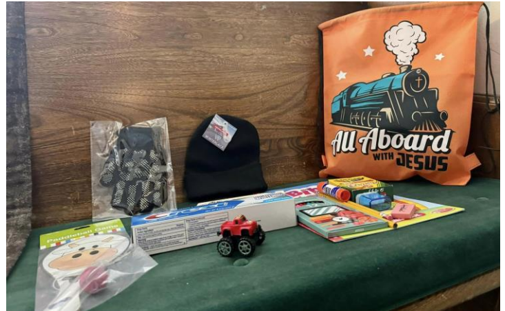
Pre-K and K bags each contained a hat, gloves, a coloring book, crayons, markers, colored pencils, pencils, an eraser and pencil sharpener, a paddle ball, scrunches for the girls, a toy car for the boys, a glue stick, a toothbrush, and toothpaste.

ANTIOCH (SCOTTSVILLE): In addition to packing 432 shoeboxes for Operation Christmas Child, Antioch also held its 2023 Election Coffee, providing free coffee and snacks to the election officials and voters. On November 3, their Adaptive Activity and Family Meal for special needs students of the Fluvanna High School was enjoyed by all in attendance. They were served a spaghetti and salad meal followed by an ice cream bar where the students were able to choose their ice cream flavor and toppings. Some families also enjoyed playing pool and foosball in the youth wing of the church. Their Fall Festival was held on November 4. Truly a family event with free entertainment, games, and food, it was hard to determine if the 100+ members/workers or the 500+ guests that attended enjoyed themselves the most! Antioch members look forward each year to giving this gift to their community.