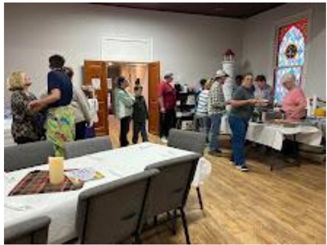
Adaptive Activity and Family Meal