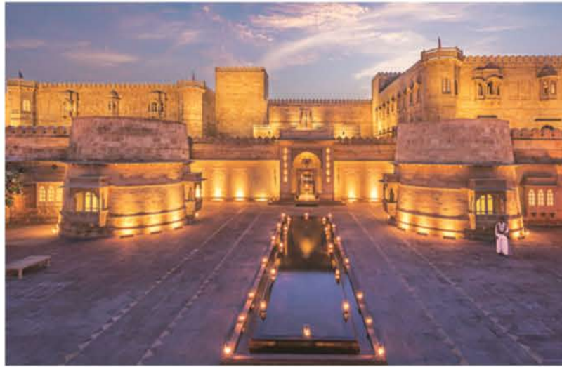
Suryagarh (above) in Jaisalmer, with room tariffs in the range of ₹48,000 to ₹55,000 in the peak season, has slashed rates to ₹15,000 to ₹16,000 per night during the off-season summer months