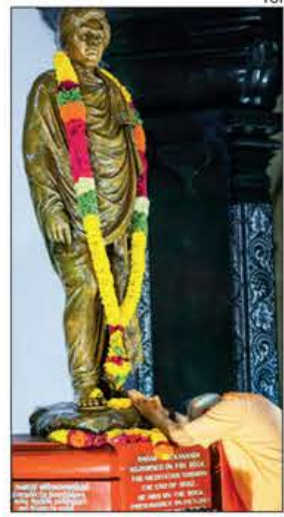
PAYS RESPECT: Prime Minister Narendra Modi has been meditating from Thursday evening to Saturday afternoon at the Dhyana Mandapam where Swami Vivekananda is believed to have meditated

The Prime Minister further noted that Swami Vivekananda, a leader of spiritual renaissance, has been his ideal, energy and source of