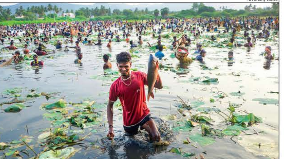
GOOD CATCH: A villager shows his catch after taking part in community fishing on the eve of the summer harvesting season at Kallanthiri near Madurai on Saturday