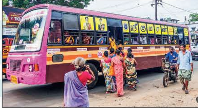
AREAS WITH HIGH FOOTBOARD TRAVEL: Vayalur Main Road | Thuvakudi | Main guard gate | Manachanalur | Kulamani Road

Only 1,500 have automated doors, all of them newly added or modified buses. Out of 282 TNSSTC city buses in Trichy, only 33 have automated doors.