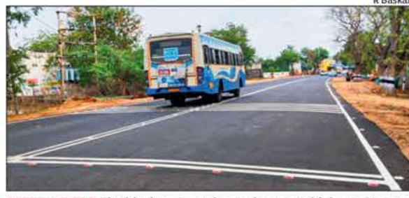
MORE ROOM: The blackspot was located on state highway 62 near the Karuppu temple at Poonampalayam village

The blackspot was located on a road curve in the state highway near the Karuppu temple at Poonampalayam village. As cars and tourist buses passing through the stretch make random stoppages near the temple to worship, even at the odd hours, many fatal accidents were reported on the 360-m stretch. Speeding vehicles heading towards Thuraiyur while trying to overtake the stationary vehicles were involved in fatal accidents due to the narrow carriageway. Subsequently, police clas-