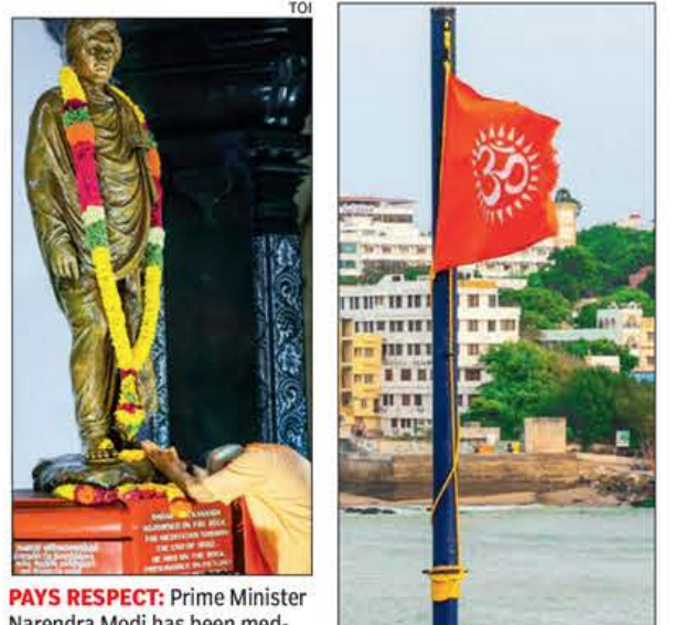
PAYS RESPECT: Prime Minister Narendra Modi has been meditating from Thursday evening to Saturday afternoon at the Dhyana Mandapam where Swami Vivekananda is believed to have meditated

Kanyakumari: Prime Minister Narendra Modi on Saturday wrapped up his 45-hour meditation and visit to Vivekananda Rock Memorial by paying floral tributes to the statue of Tamil poet Thiruvalluvar. The Prime Minister has been meditating from Thursday evening to Saturday afternoon at the Dhyana Mandapam where Swami Vivekananda is believed to have meditated. After completing his meditation, Modi took a ferry to the 133-foot statue of Thiruvalluvar located near the rock memorial. Dressed in white, he placed a floral garland at the statue.