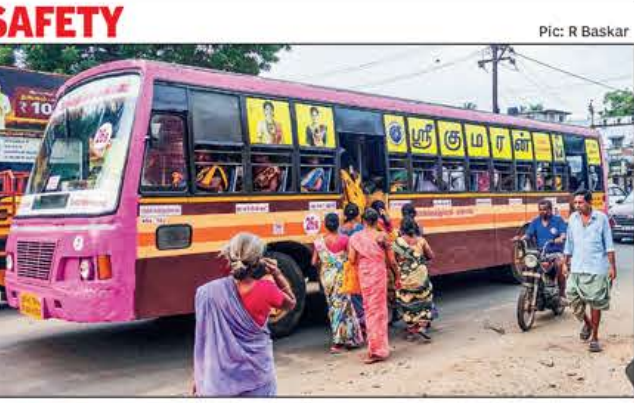
AREAS WITH HIGH FOOTBOARD TRAVEL Vayalur Main Road | Thuvakudi | Main guard gate | Manachanallur | Kulamani Road

the city, Samayapuram, Manachanallur and Thuvakudi in the suburbs will be given priority in adding doors. "In retrofitting, we will focus on buses five to 10 years old. Much older buses such as mofussil ones used in city operations will be fitted with doors at the time of total body refurbishment," an official of TNSSTC Trichy added. Road safety activists while welcoming the move have urged authorities to make automated doors mandatory for private buses too. Around 150 of them ply in the city and suburbs.