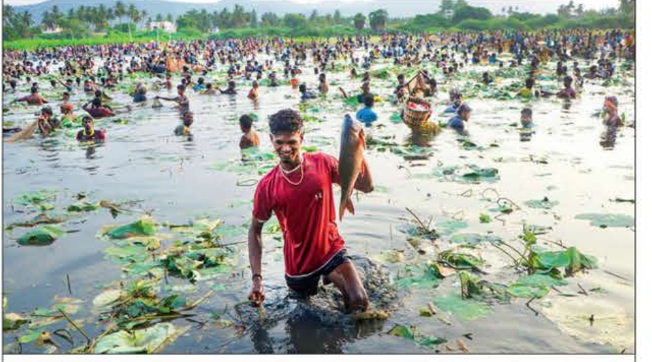
GOOD CATCH: A villager shows his catch after taking part in community fishing on the eve of the summer harvesting season at Kallanthiri near Madurai on Saturday