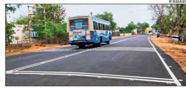
MORE ROOM: The blackspot was located on state highway 62 near the Karuppu temple at Poonampalayam village

Trichy: The state highways department has completed works to eliminate a blackspot on SH 62 connecting Thuraiyur town and adjoining villages with Trichy. The blackspot was located on a road curve in the state highway near the Karuppu temple at Poonampalayam village. As cars and tourist buses passing through the stretch make random stoppages near the temple to worship, even at the odd hours, many fatal accidents were reported on the 360-m stretch. Speeding vehicles heading towards Thuraiyur while trying to overtake the stationary vehicles were involved in fatal accidents due to the narrow carriageway. Subsequently, police clas-