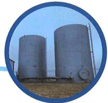
3: Storage Tank