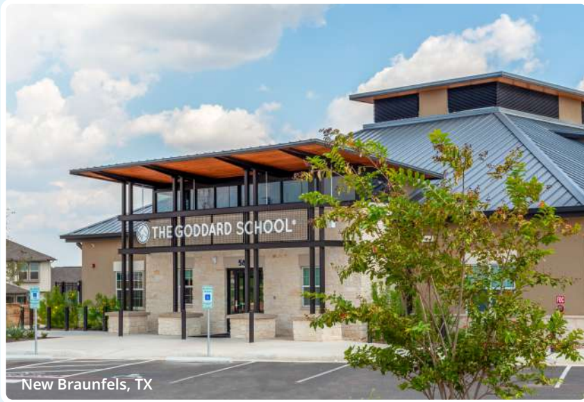
New Braunfels, TX

DEVELOP WITH PURPOSE AS WE EXPAND TO SUPPORT FAMILIES NATIONWIDE