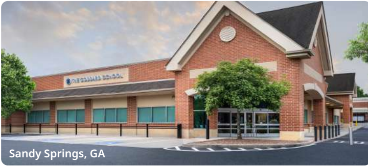
Sandy Springs, GA