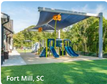
Fort Mill, SC

Will Consider 2-Story Locations – 5,000SF Required on Ground Floor