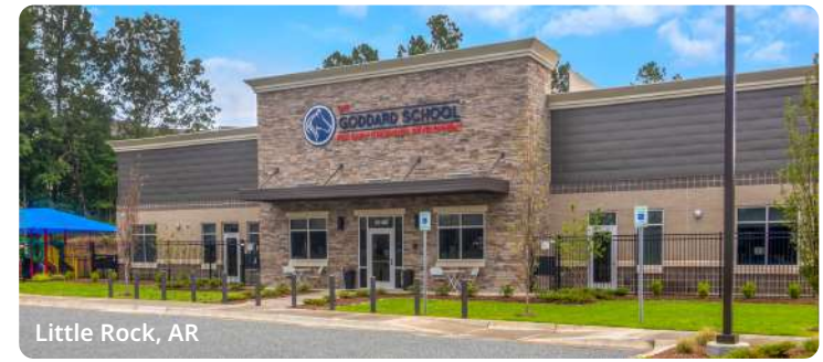
Little Rock, AR