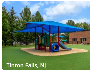
Tinton Falls, NJ