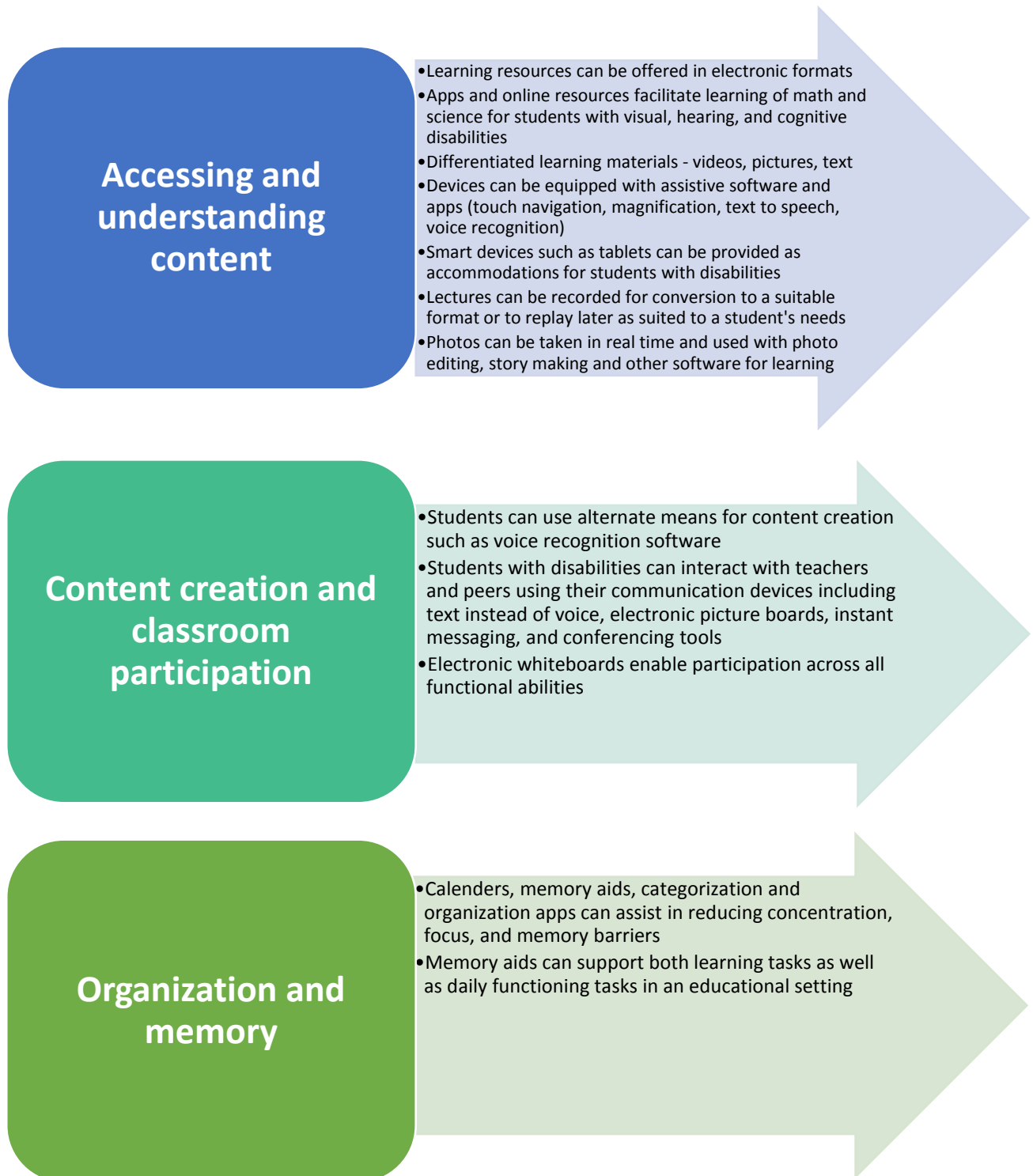
Figure 1: How ICT addresses barriers to participation in education for persons with disabilities