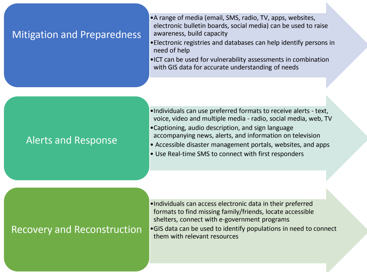
Figure 4 How ICT facilitates access to emergency and disaster management for persons with disabilities

Electronic registries and databases are being used at local government and community levels to assist responders in identifying individuals who need additional assistance due to disability during a disaster and allocating accessible evacuation and response resources (IFRC 2007; Smith, Jolley and Schmidt 2011). Such registries have to be governed by strong ethical codes to ensure that individuals' privacy is not violated and their confidential data is appropriately used (Samant Raja and Narasimhan 2013). "Big data" practices can analyze passively generated and crowdsourced