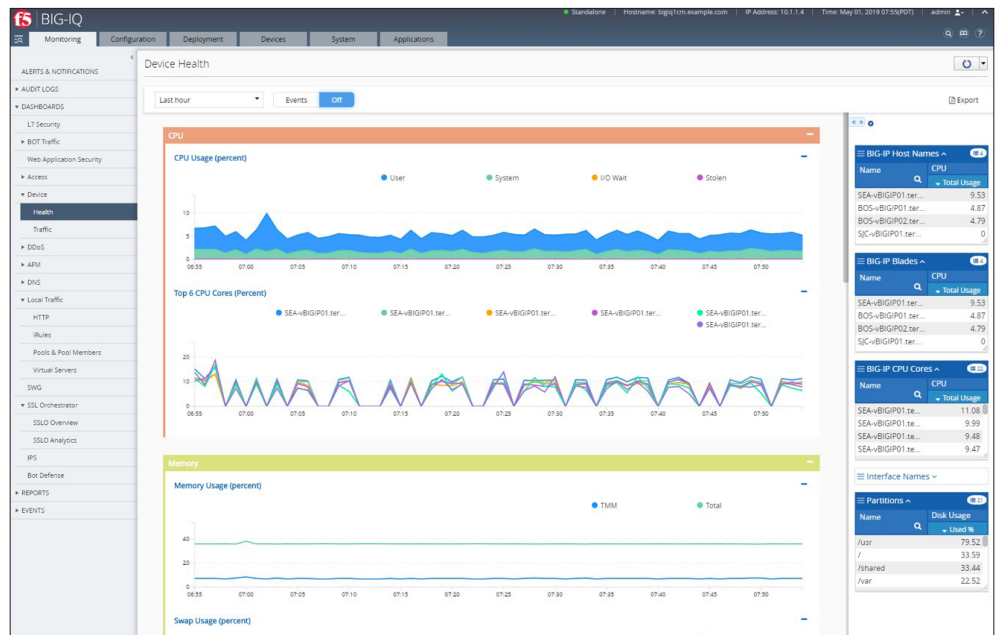
Figure 3: Manage your BIG-IP appliance health and track CPU and memory usage of physical and virtual platforms, hardware blades, and cores with BIG-IQ. Use logging and reporting to understand overall trends and spot areas needing correction. Easily manage policies, certificates, and licensing management to push out to all BIG-IP ADCs for centralized control of app services infrastructure.