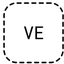
BIG-IP Virtual Editions