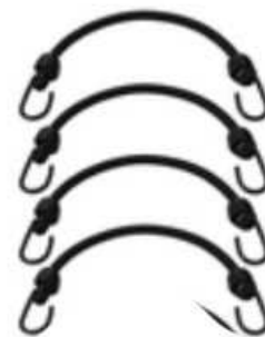
Mini Bungee Cords (x4)