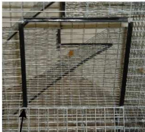
Plastic Door Guards (Shown in Black)