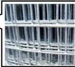
1"x2" Hardware Cloth

OPTIONAL: 1"x1/2" Hardware Cloth (if you want a wire floor)