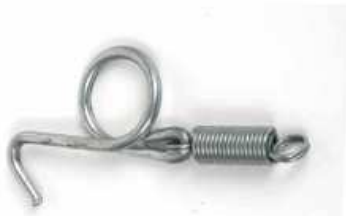
Spring Door Latch (x4)

OPTIONAL: 1"x1/2" Hardware Cloth (if you want a wire floor)