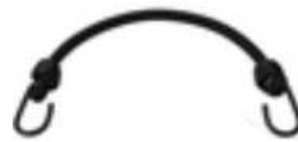
Mini Bungee Cord