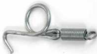
Spring Door Latch