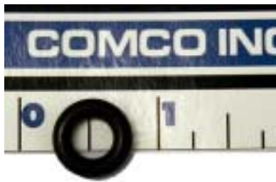
ST5496 – O-ring (2) (.296ID x .139THK)