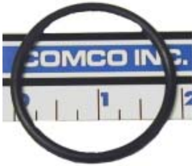
ST5023 – O-ring (1) (1.734ID x .139THK)