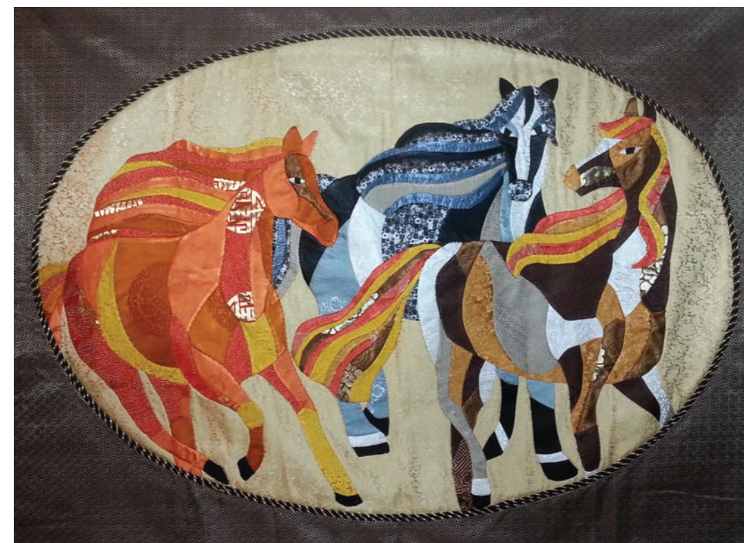
Mighty Three , 52" x 38", 2014, by Byambalaa Lhagvansuren

At the Center we encouraged the women to develop silk products to sell since we knew these would be popular with tourists. Silk is manufactured in China especially for Mongolians and is readily available in