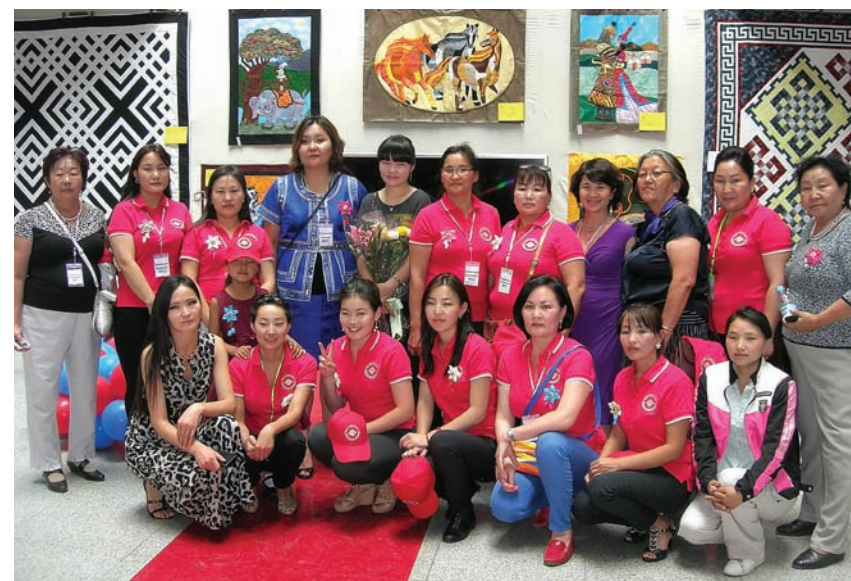
Designers, teachers and other employees of the Mongolian Quilting Center

When funds that had been pledged from Japanese donors fell through later that year, my church, St. Barnabas Episcopal Church on Bainbridge Island, Washington, sent $4,000, enabling Selenge to open a new Center in the basement of a block of apartments. However, there were