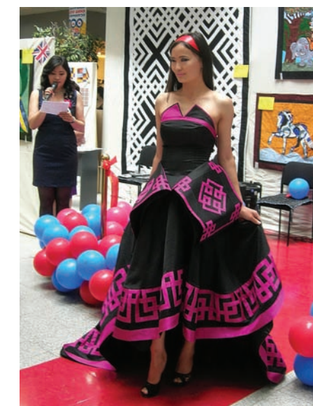
Garment designed by Shiilge Bat-Ulzii