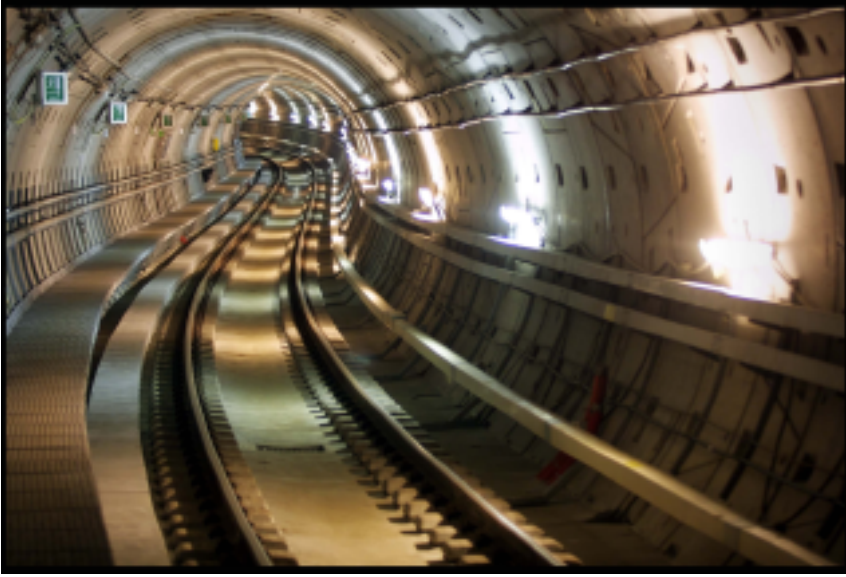
"Copenhagen Underground" by Michael Altschul

Some aspect of the project's work moves beyond adequate, beyond even elegant . . . and reaches for the sublime.