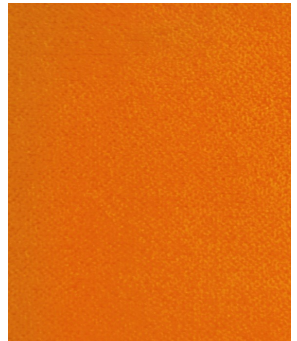
Royal Yellow 0011M