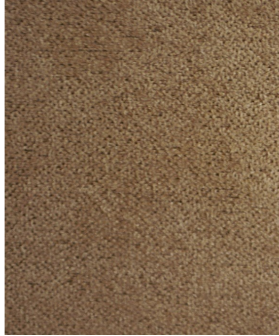
Burmese Beige 8012M