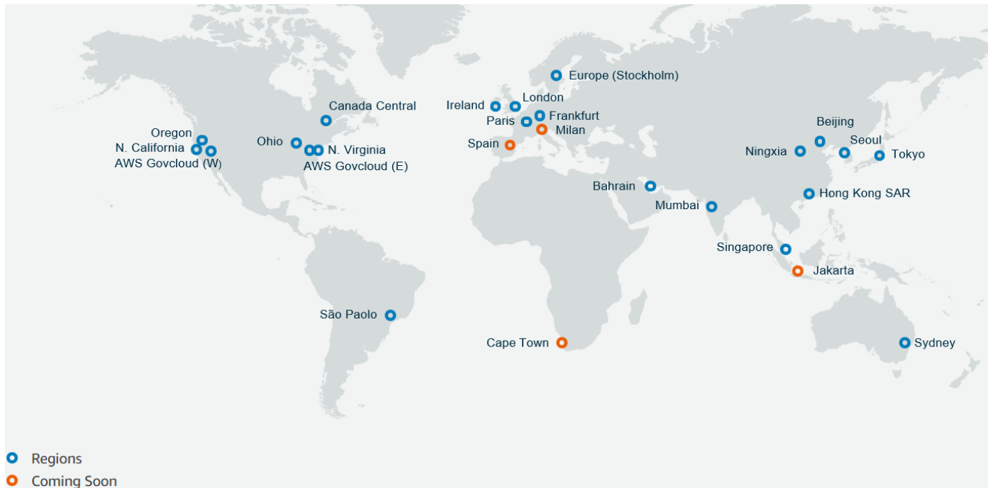
Figure 2 – AWS Global Regions

AWS customers choose the AWS Region or Regions in which their content and servers will be located. This allows customers with geographic specific requirements to establish environments in a location or locations of their choice. For example, AWS customers in Australia can choose to deploy their AWS services exclusively in one AWS Region such as the Asia Pacific (Sydney) Region and store their content onshore in Australia, if this is their preferred location. If the customer makes this choice, AWS will not move their content from Australia without the customer's consent, except as legally required.