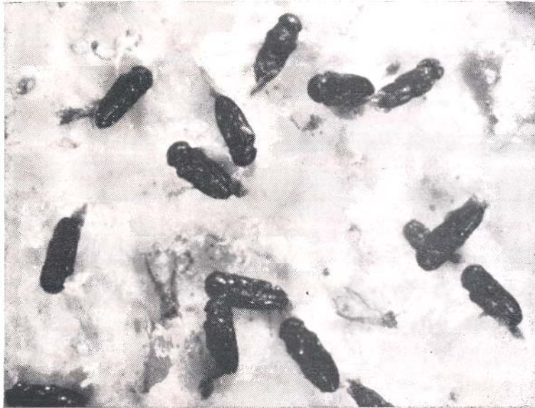
Fig. 2. Pupae of the parasite Dasyscapus parvipennis Gahan, on surface of orange fruit.