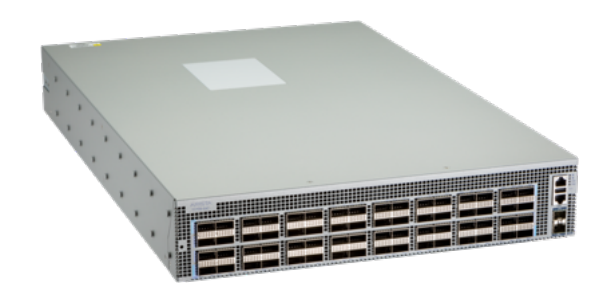
Arista 7170B-64C: 64x 100GbE QSFP100 ports, 2 SFP+ ports