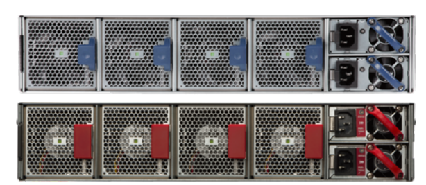
7170 2RU Rear View: Rear to Front and Front to Rear