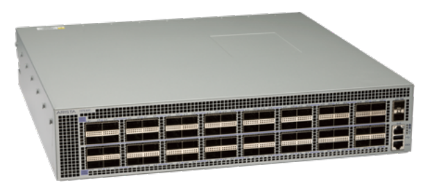
Arista 7170-64C: 64x 100GbE QSFP100 ports, 2 SFP+ ports