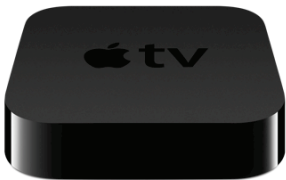
Models MD199 Date introduced March 7, 2012