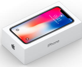
U.S. retail packaging of iPhone X contains 55 percent recycled content.