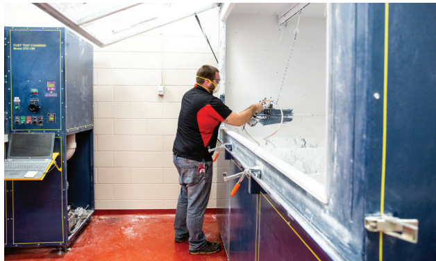
IP dust testing