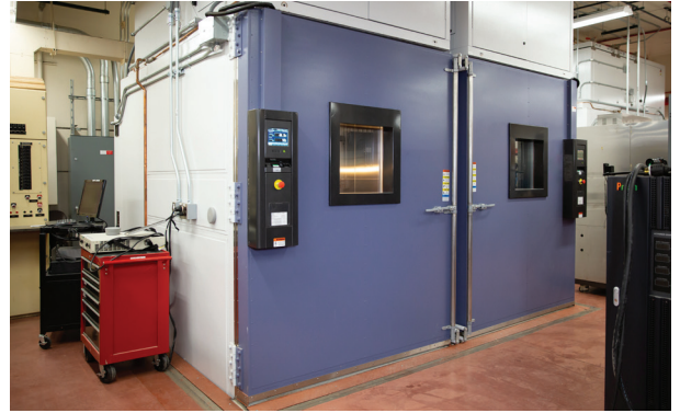
Walk-In climactic chambers