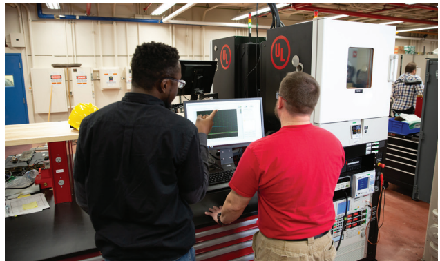
Vertical test station