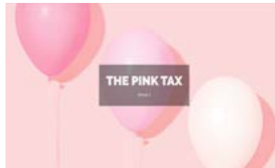
“The Pink Tax” created by students Winston-Salem State University