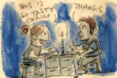
TABLE MADE OF BOXES AND A STRETCHED CANNAS I HAD JUST MOVED.

I'VE MADE A LITTLE SOMETHING FOR YOU THAT I WANT TO SHOW YOU!