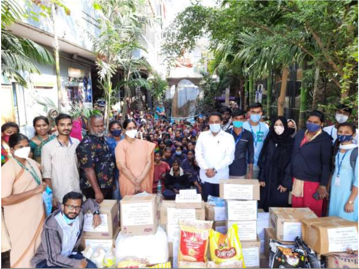
Outreach program at the destitute home of Auto Raja The students from the college provided provisions , snacks and toiletries for the destitute women, men and children of the home