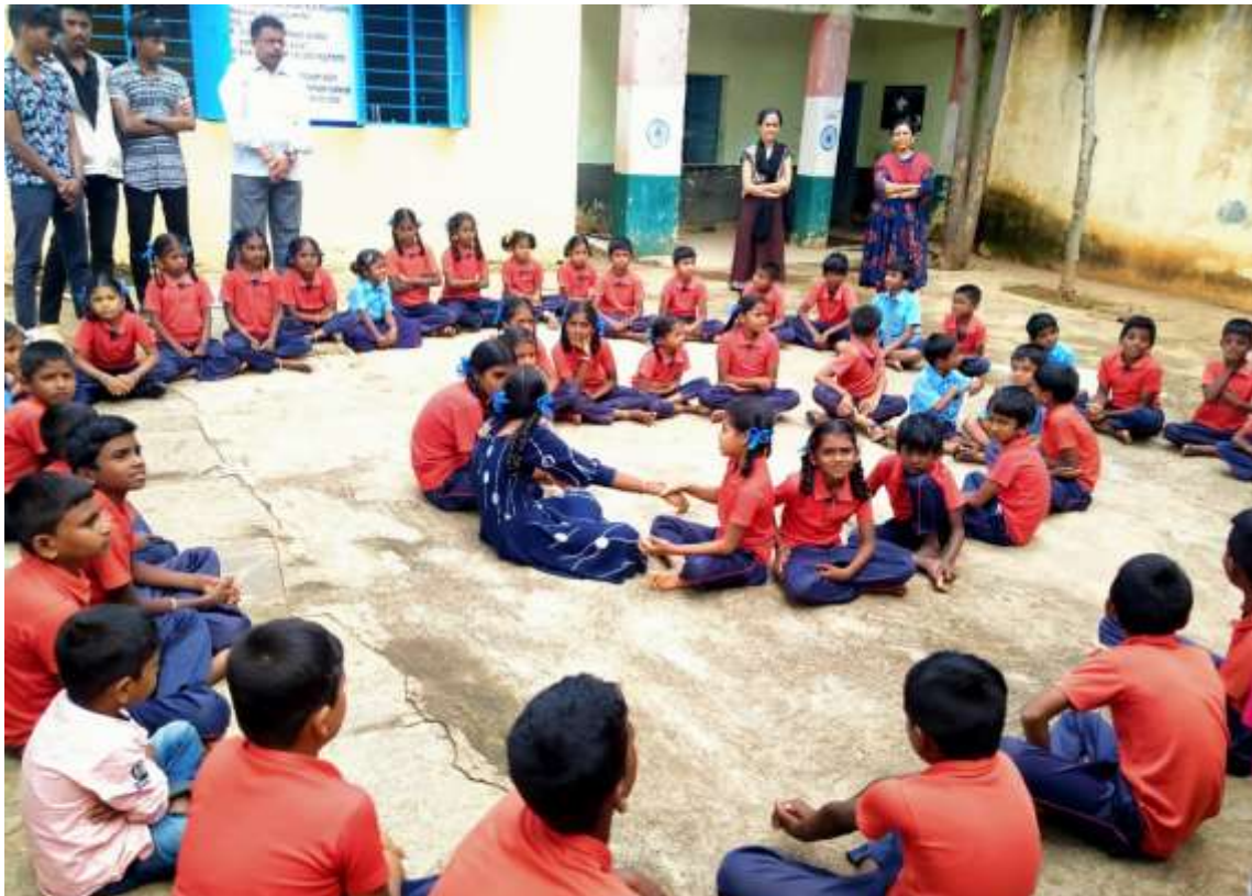
St. Aloysius students providing classes on Health and hygiene for the students of Government school in Sgarahalli, Rural Bangalore