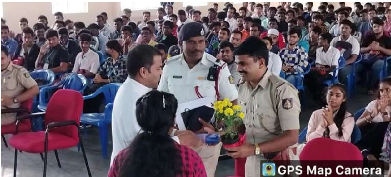
Anti-drug day observation