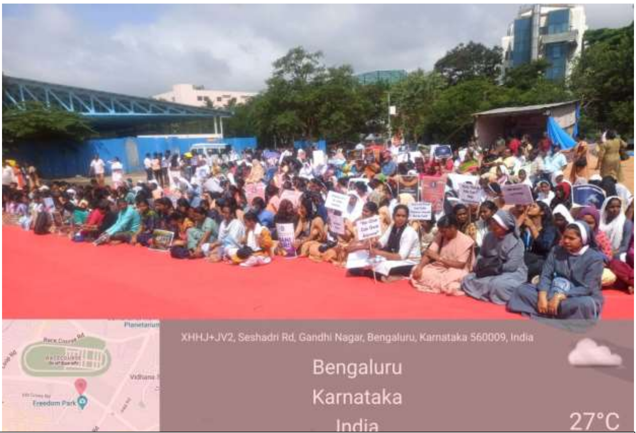
staff and students in solidarity with the attach on minority participating in protest at Freedom Park, Bangalore