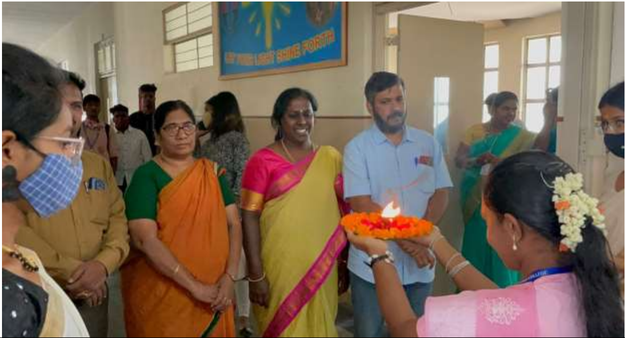
College, On its efforts to have an inclusive community – having continues network with the LGBTQ Community