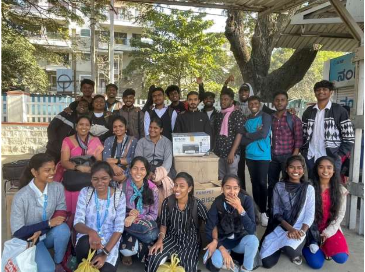
Outreach program in Sagarahalli, Devanahalli, Bangalore distributing blankets and provisions for the elderly .