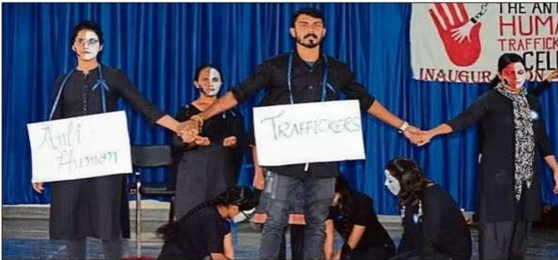
Students from St Aloysius Degree College present a mime show on human trafficking.

During the launch, students of the college presented a mime show on various forms of human trafficking and its impact on humanity. They pledged to work together to ensure safer communities and create awareness within the campus and in society. The club will ensure collaboration between different stakeholders to build a vigilant and resistant community, the students said.