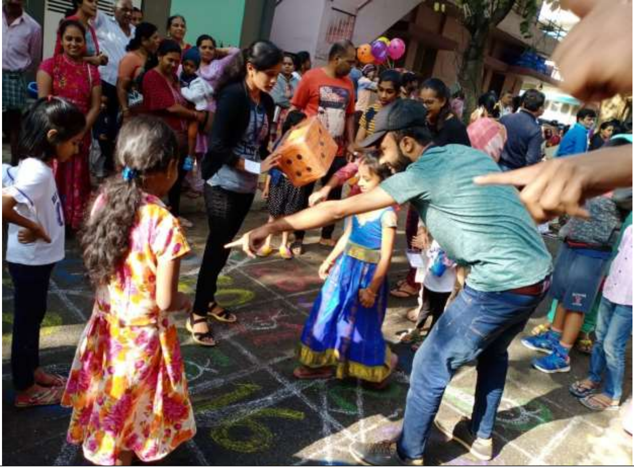
Our students are organizing program in the Bangalore slum for the education of girl children