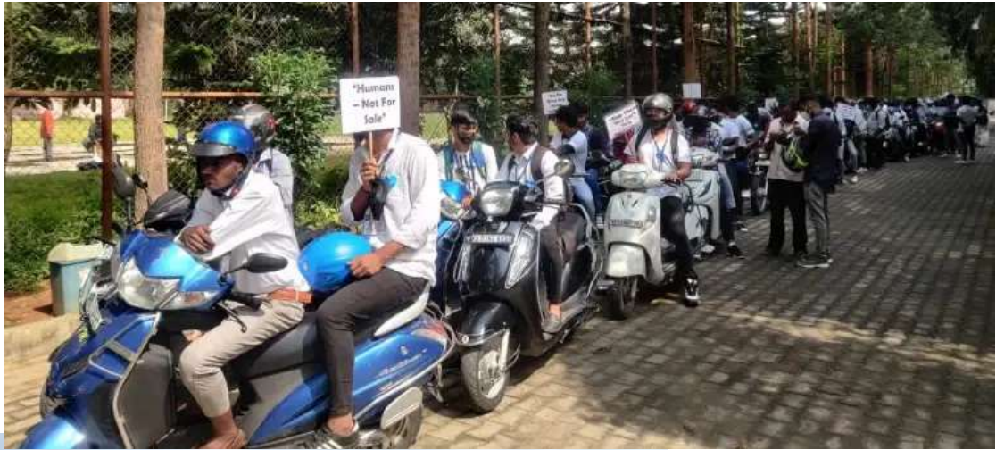
Anti-Human Trafficking observation with Railway Protection Force- Bike rally and awareness program at Majestic Railway Station