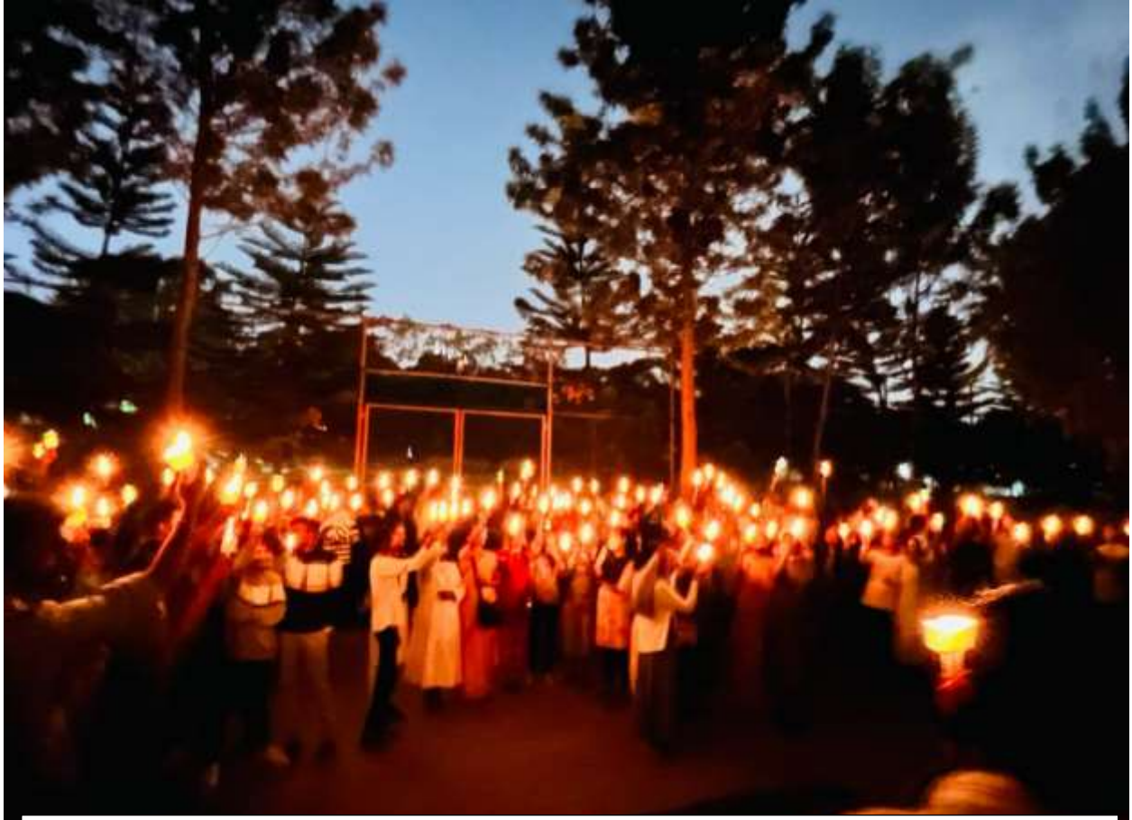
Candle vigil in solidarity with the suffering people of Manipur – Organized prayer and silent rally