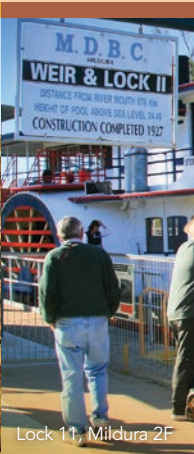
Lock 11, Mildura 2F