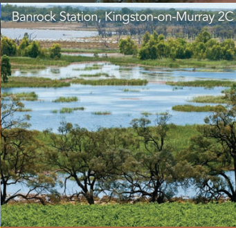
Banrock Station, Kingston-on-Murray 2C