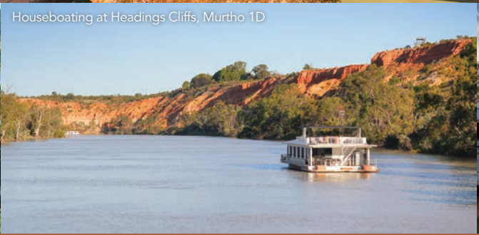
Houseboating at Headings Cliffs, Murtho 1D