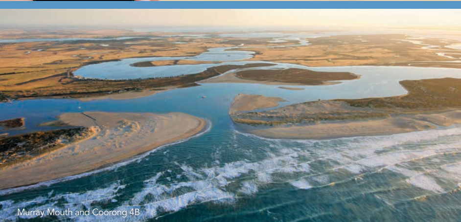
Murray Mouth and Coorong 4B