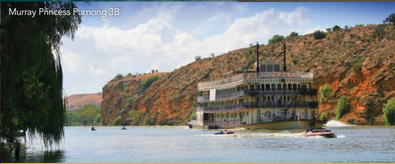
Murray Princess Purnong 3B