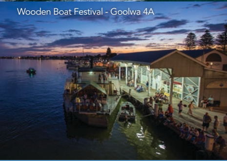
Wooden Boat Festival - Goolwa 4A