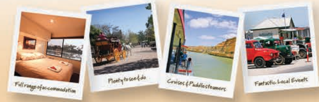
Full range of accommodation